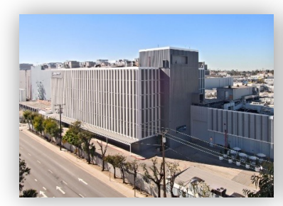
Exterior of Boeing Satellite Factory

Boeing's satellite systems business is located in El Segundo, Calif. The world's first geosynchronous communications satellite, Syncom, was built there by Boeing and launched in 1963. Since then, Boeing has delivered more than 300 satellites to more than 50 customers in more than 20 countries, and continues to design and build government and commercial satellites in its factory in El Segundo.