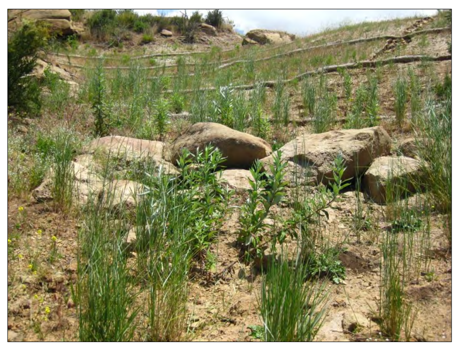
Figure B1. View of CTL-1A with substantial growth of plantings and germinated hydroseed. Photograph is toward the south, taken on June 1, 2011.