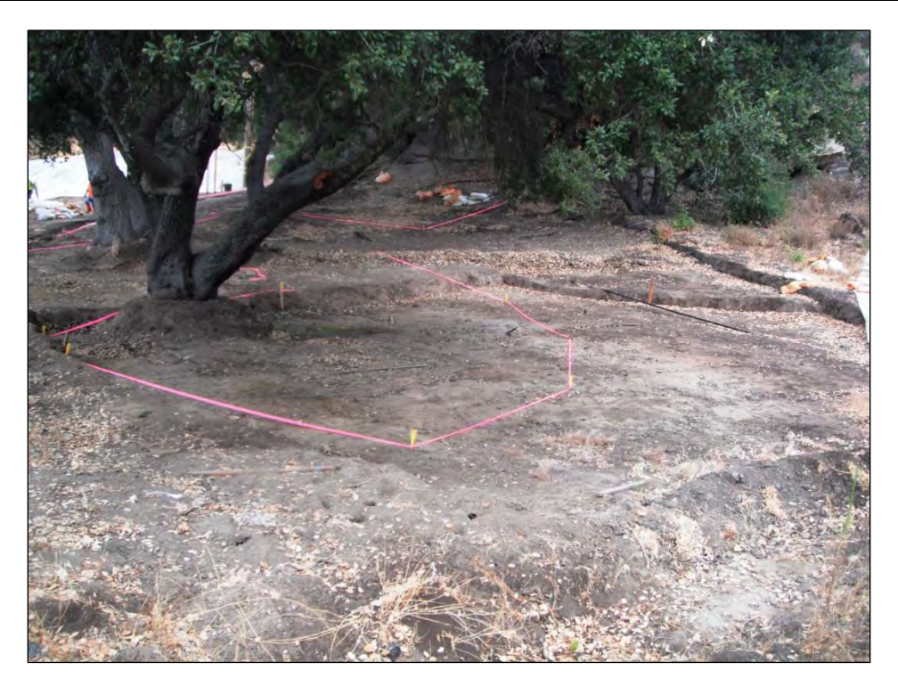
Figure 2. Excavation area beneath oak trees located within the western section of AP/STP-1C-2. View is toward the east.