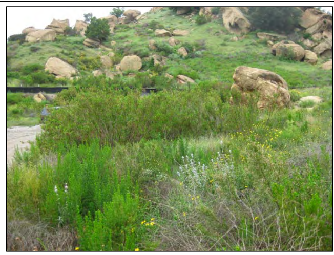
Views of HVS-2A and HVS-3, respectively, with plantings mainly on left side and hydroseeding on the right side of each photo.