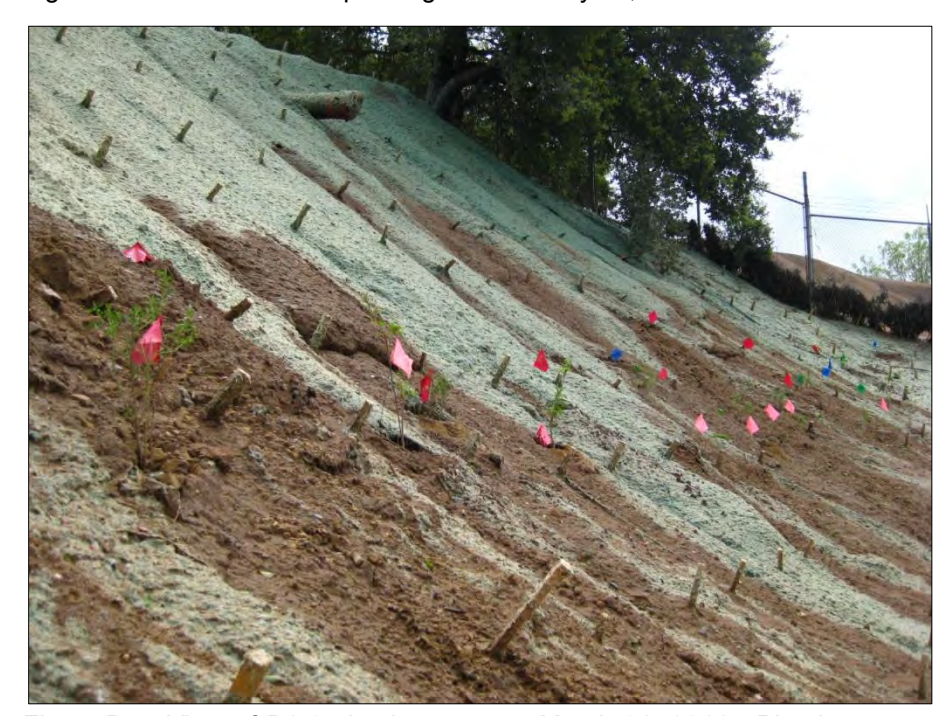
Figure B4. View of B1-2 planting area on March 21, 2011. Plantings were installed, and slope was covered in jute netting and hydroseeded.