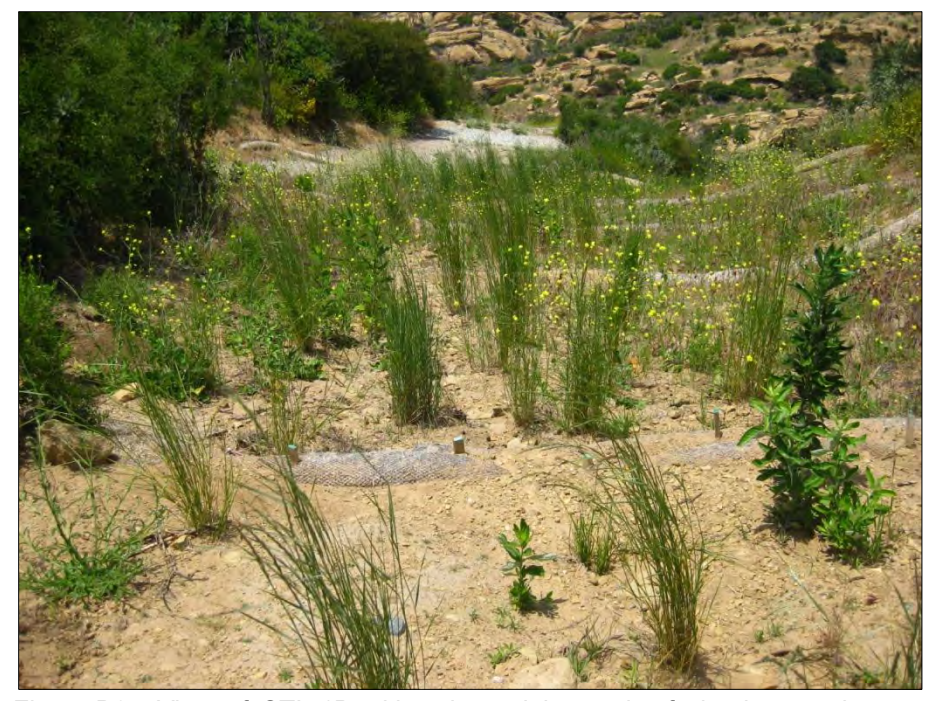
Figure B2. View of CTL-1B with substantial growth of plantings and some summer mustard infestation. Photograph is toward the north, taken on June 1, 2011.