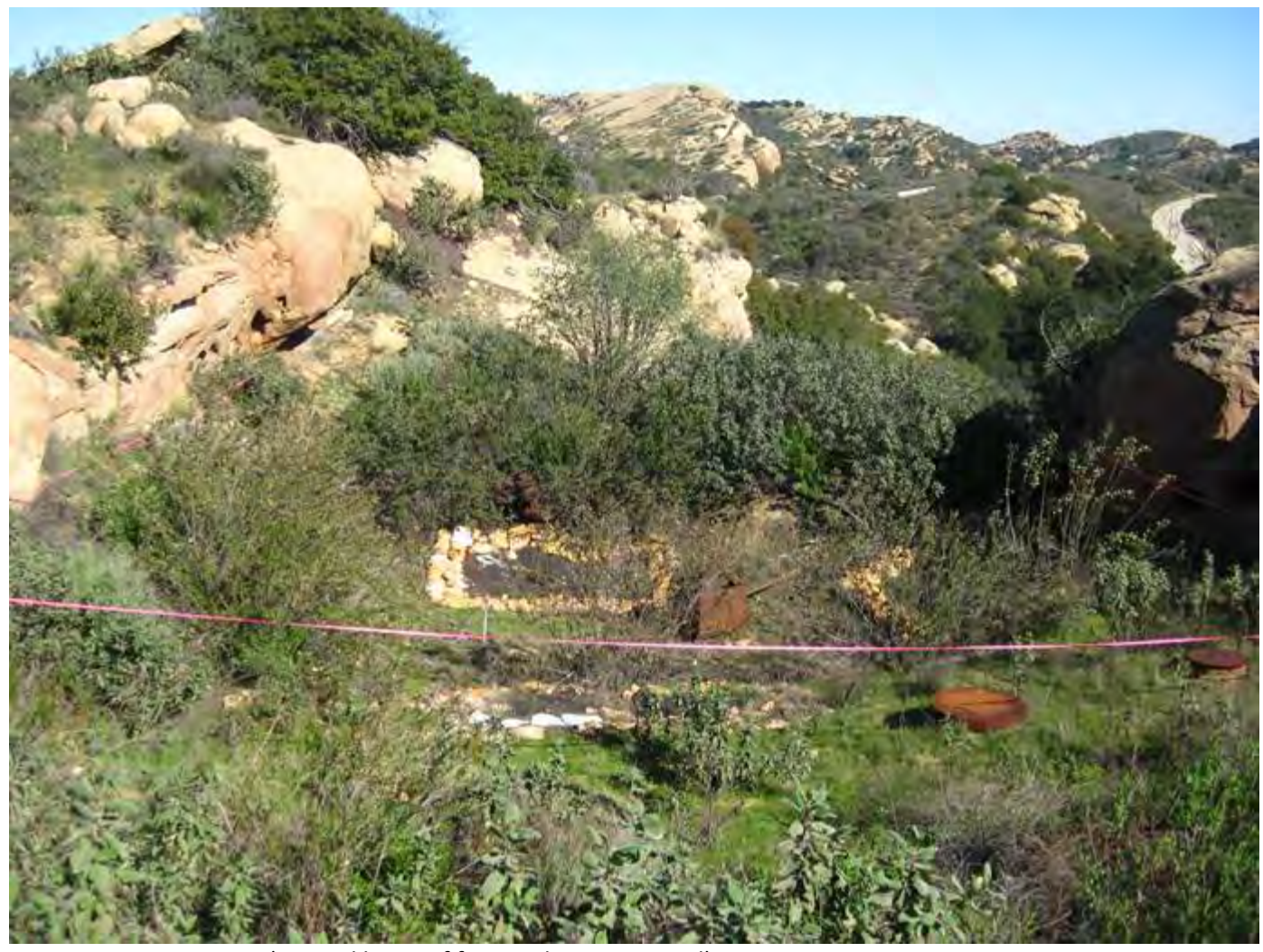
ELV-1D excavation area (general limits of former detention pond).