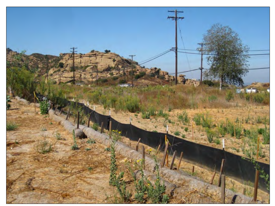
Figure B5. View of IEL-2 on September 23, 2010, prior to ISRA activities. Photograph is toward the southwest.