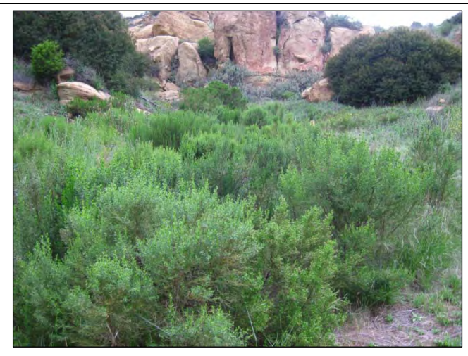
Views of HV-PLANT1 and HV-PLANT2, respectively, exhibiting colonization in remnant unpaved roadways.