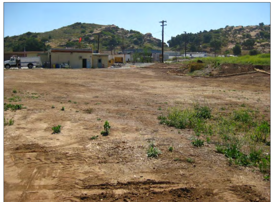
Figure B6. View of IEL-2 on June 22, 2011, subsequent to ISRA activities. Photograph is toward the northeast. Hydroseeding will be completed upon receipt of soil analytical results.