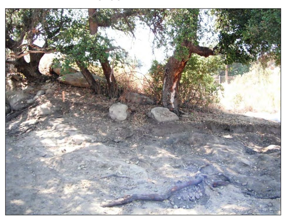
Figure 1. Excavation area beneath oak trees located along the western margin of AP/STP-1C-1. View is toward the west.