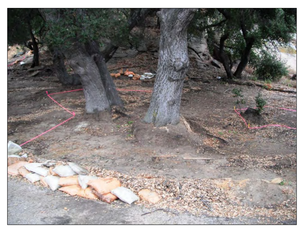
Figure 3. Excavation area beneath oak trees located within the middle section of AP/STP-1C-2. View is toward the south.