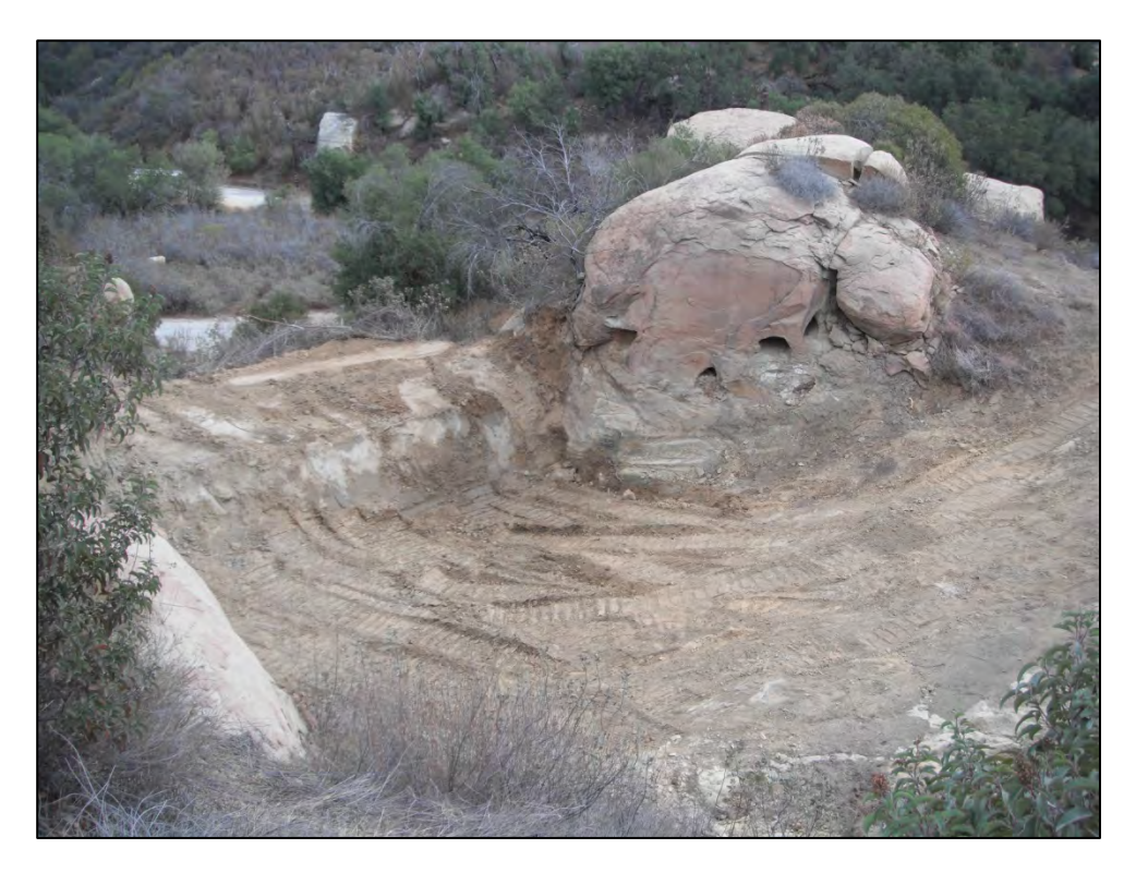
View of ISRA area ELV-1D excavation after contouring (10/29/2013, looking southeast).