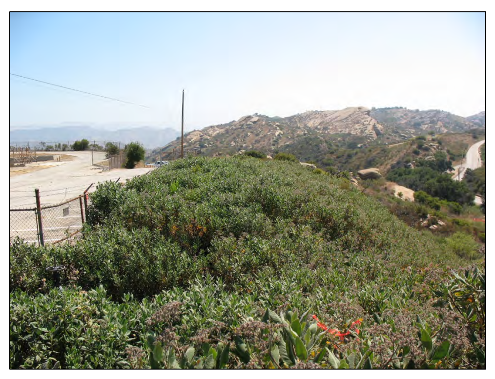
View of ISRA area ELV-1C (western portion) prior to vegetation clearance (6/18/09, looking east).