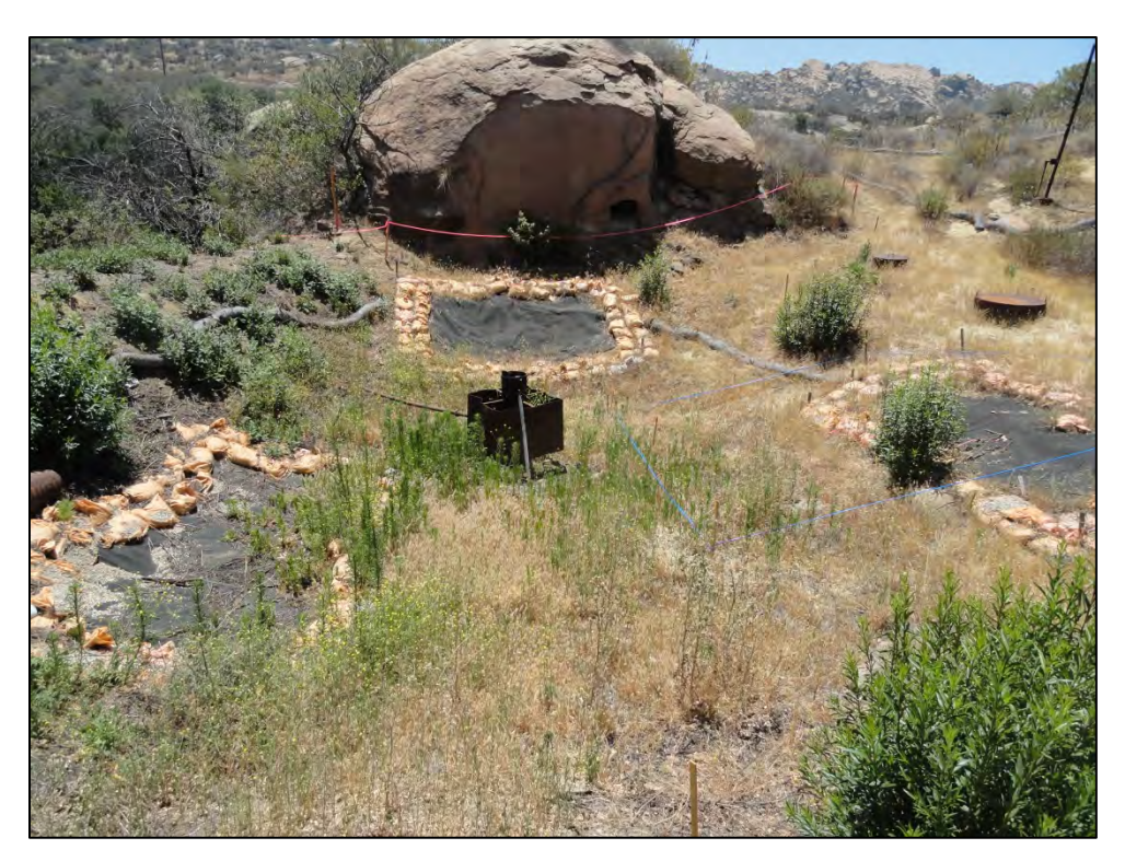
View of ISRA area ELV-1D prior to vegetation clearance (10/13/2009, looking south).