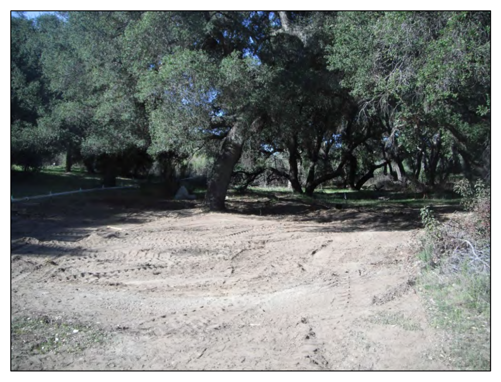
View of ISRA area AP/STP-1E-1 during contouring and prior hydroseed application (2/28/2013, looking west).