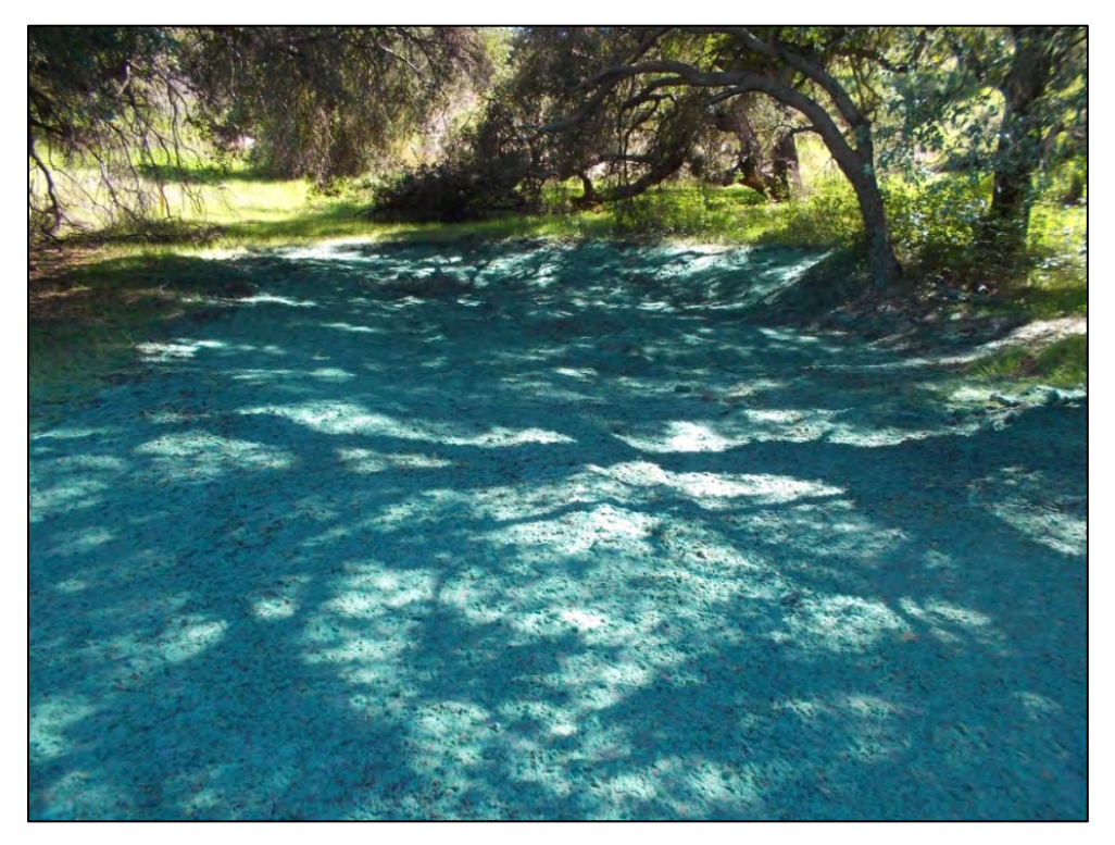
View of ISRA area AP/STP-1E-3 after hydroseed application (3/8/2013, looking southeast).