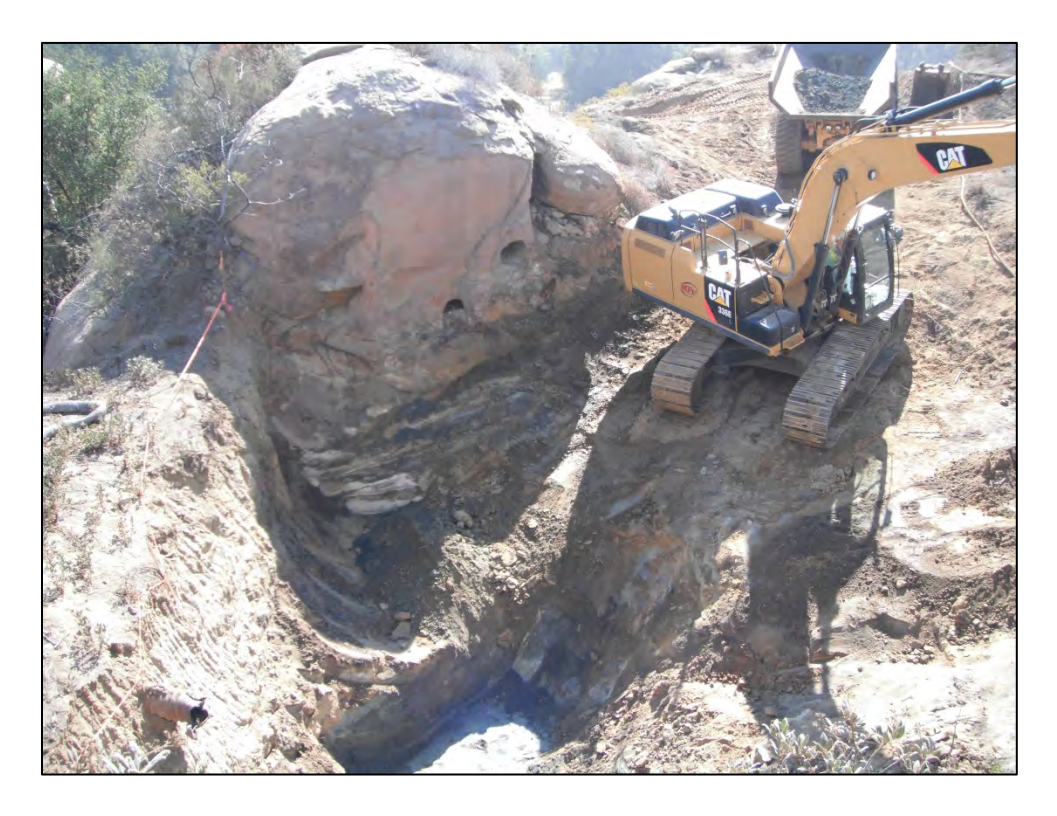
View of ISRA area ELV-1D during excavation (10/25/2013, looking south).