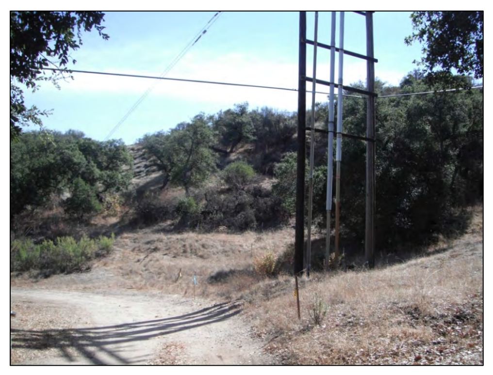
View of ISRA area AP/STP-1C-2 (central portion) prior to vegetation clearance (10/10/2011, looking southeast).