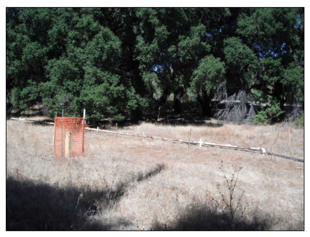
View of ISRA area AP/STP-1E-1 prior to vegetation clearance (9/1/2011, looking north).