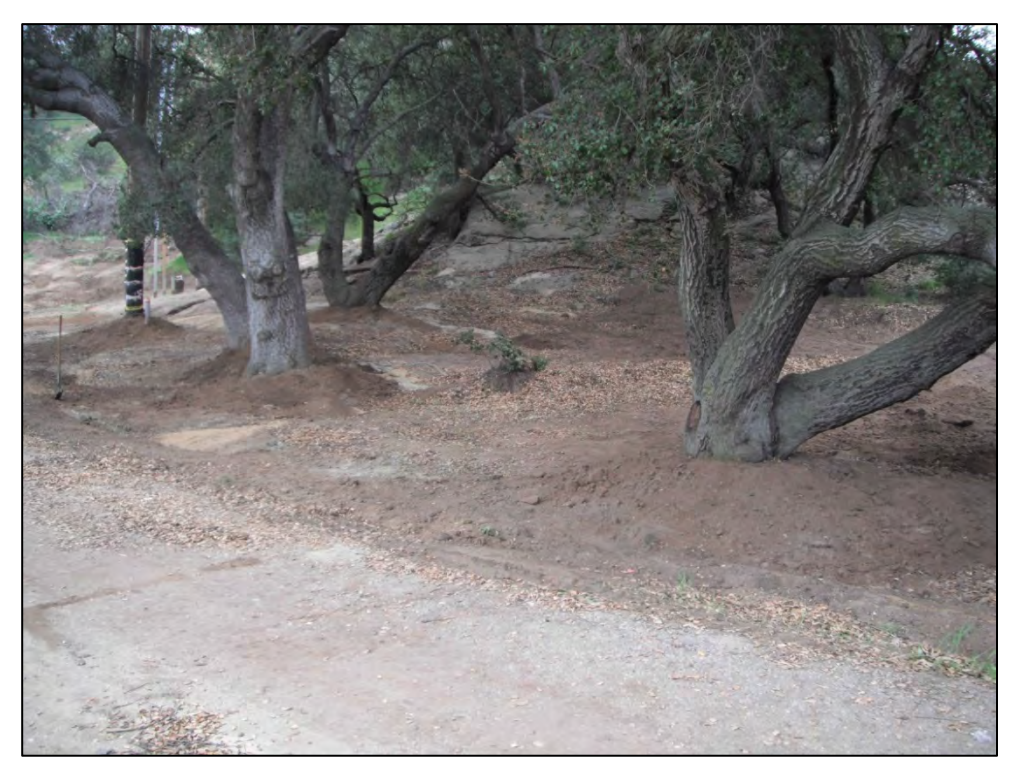
View of ISRA area AP/STP-1C-2 (northwest portion) after excavation and prior to hydroseeding (3/5/2013, looking southeast).