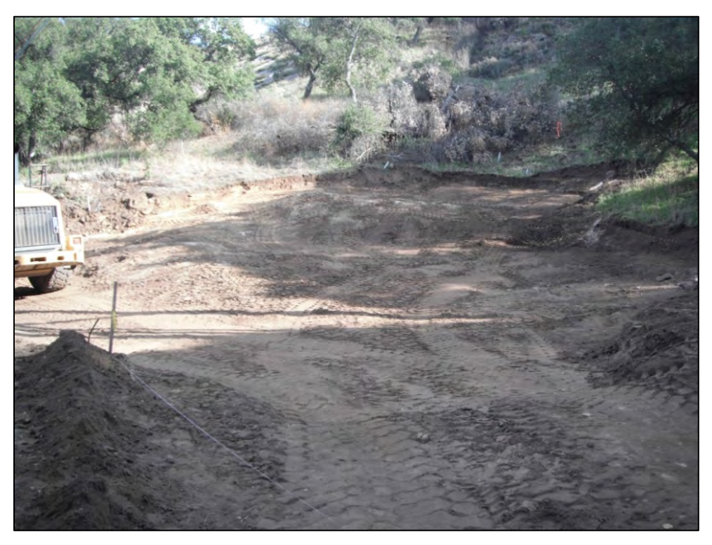
View of ISRA area AP/STP-1C-2 (central and eastern portion) during excavation (11/17/2011, looking southeast).