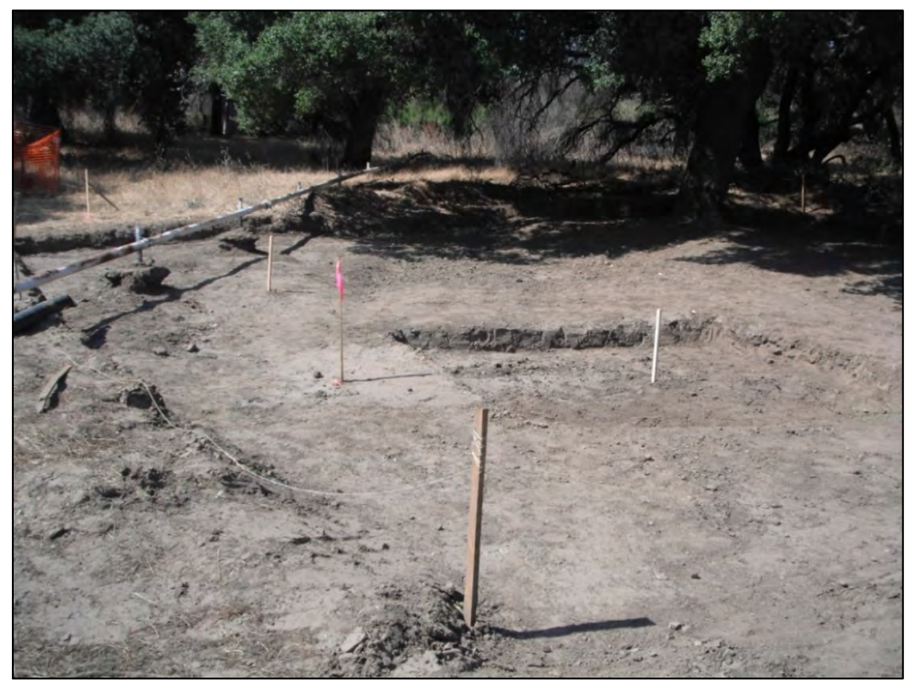
View of ISRA area AP/STP-1E-1 after excavation and during additional soil removal (9/14/2011, looking west).