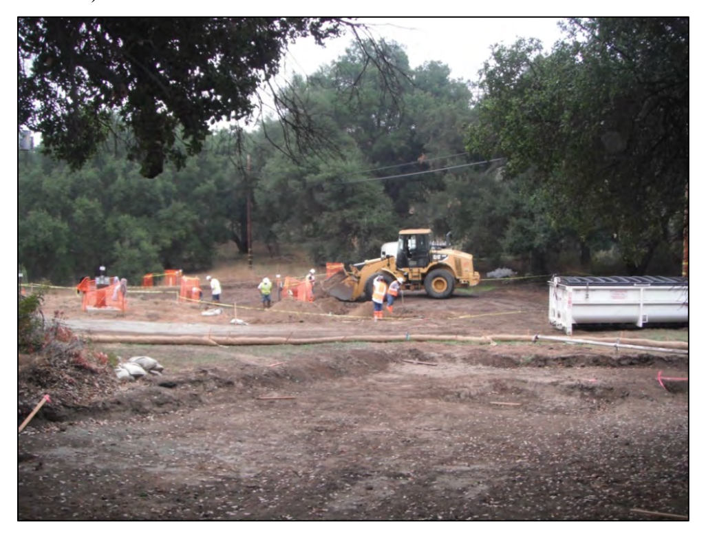
View of ISRA area AP/STP-1E-2 during excavation with ISRA area AP/STP-1E-1 in foreground (10/25/2011, looking west).