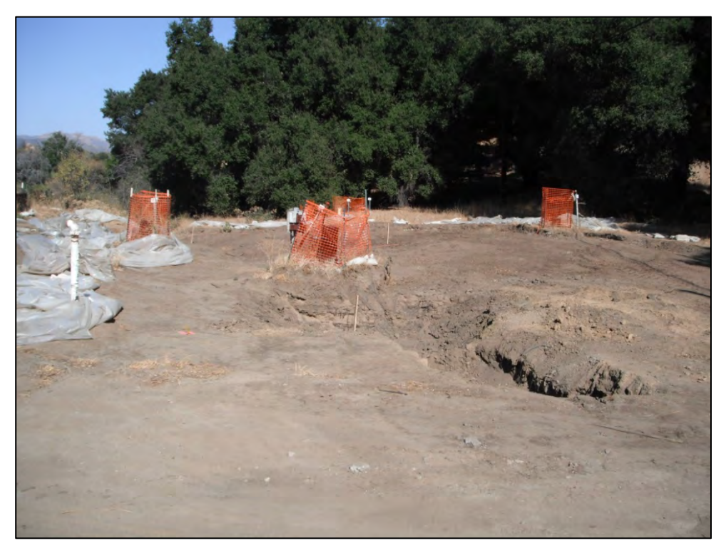
View of ISRA area AP/STP-1E-2 after additional soil removal sampling (10/1/2012, looking east).