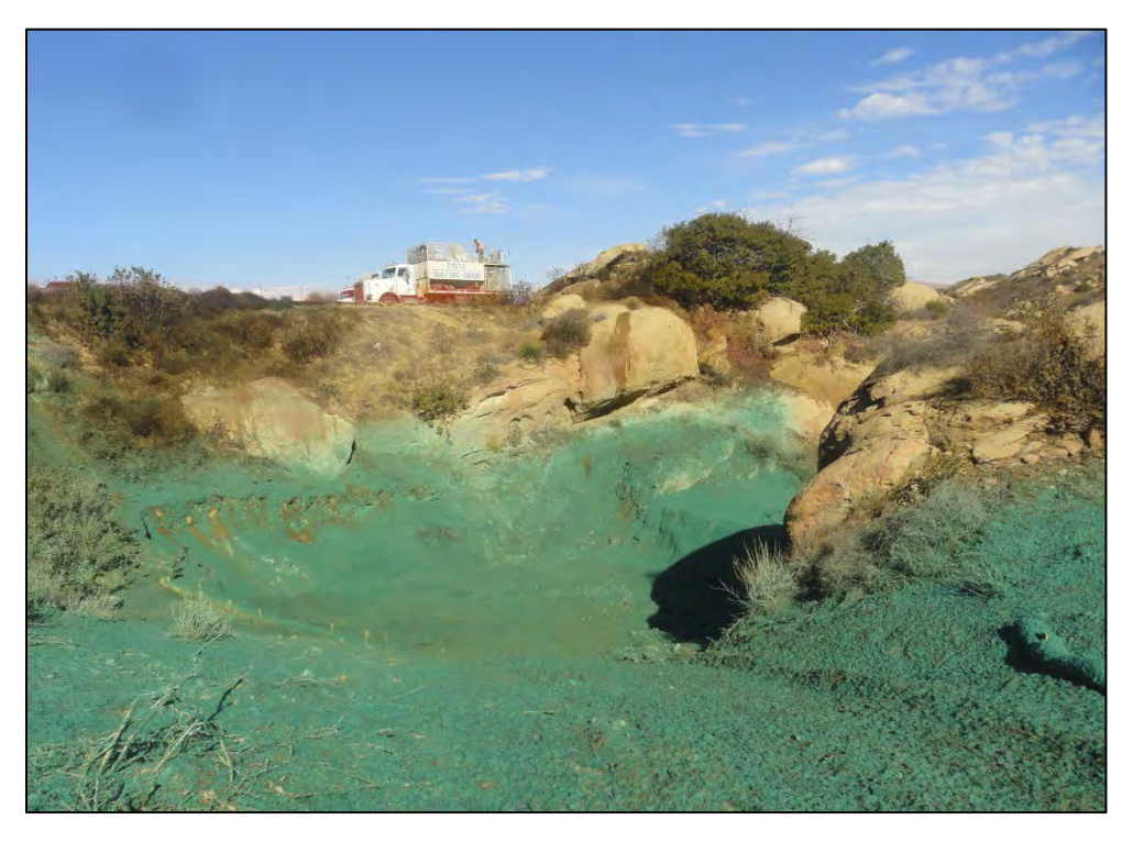
View of ISRA area ELV-1D after restoration and hydroseeding (12/2/2013, looking north).