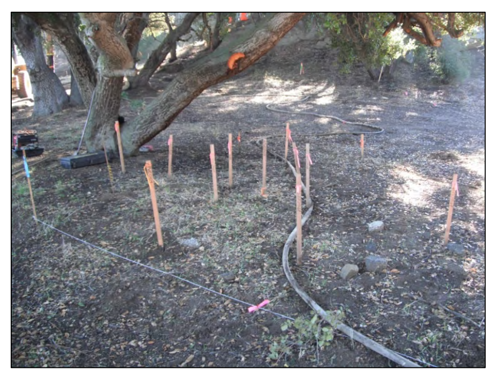
View of ISRA area AP/STP-1C-2 (northwest portion) prior to excavation (11/16/2011, looking southeast).