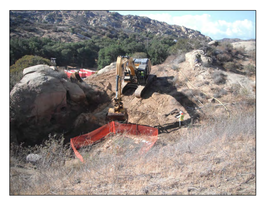
View of ISRA area ELV-1D during excavation (9/26/2013, looking south).