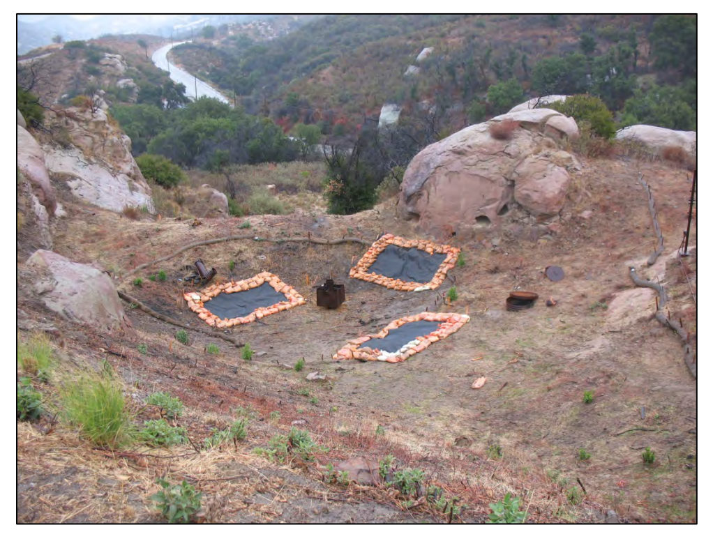
View of ISRA area ELV-1D during waste characterization sampling, prior to excavation (05/31/2013), looking south-southeast).