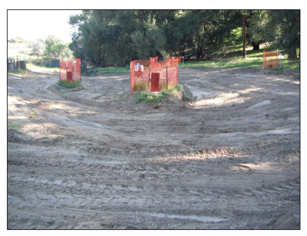
View of ISRA area AP/STP-1E-2 after soil contouring and prior to hydroseed application (2/28/2013, looking east).