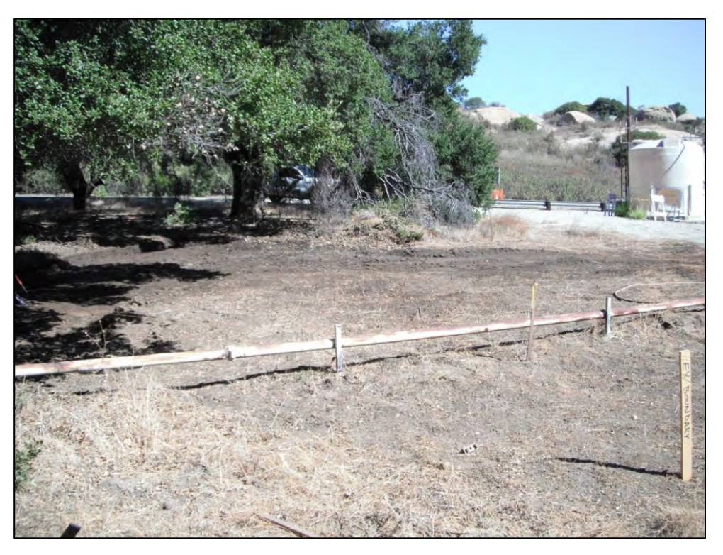
View of ISRA area AP/STP-1E-1 during excavation (9/7/2011, looking north).