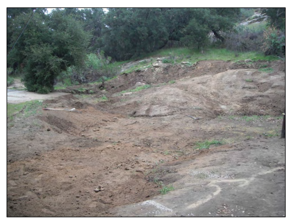
View of ISRA area AP/STP-1C-2 (southeast portion) after excavation and prior to hydroseeding (3/5/2013, looking southeast).