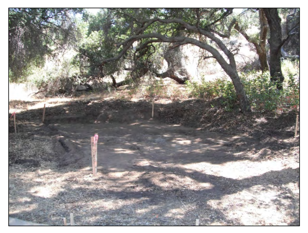
View of ISRA area AP/STP-1E-3 during excavation (9/9/2011, looking southeast).