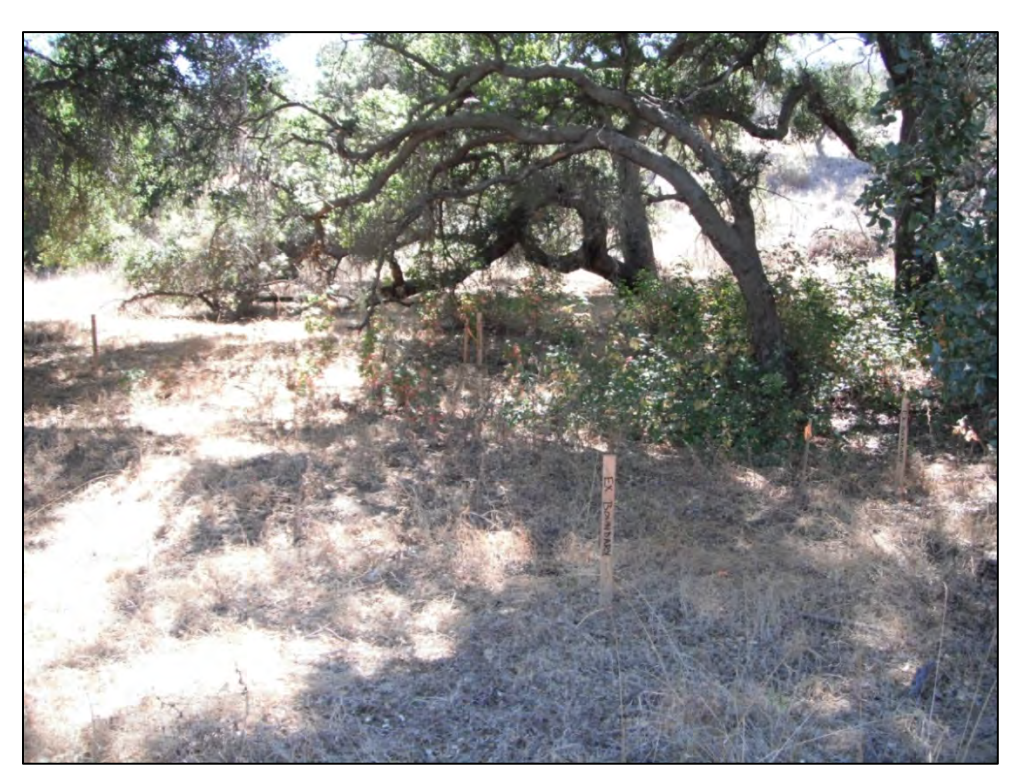
View of ISRA area AP/STP-1E-3 prior to vegetation clearance (9/1/2011, looking southeast).