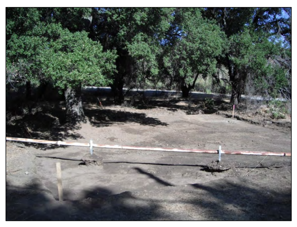
View of ISRA area AP/STP-1E-1 during excavation (9/9/2011, looking northwest).