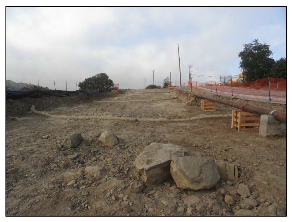
View of ISRA area ELV-1C (eastern portion) after soil removal (11/20/13, looking west).