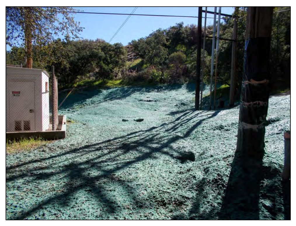
View of ISRA area AP/STP-1C-2 (southeast portion) after hydroseed application (3/8/2013, looking southeast).