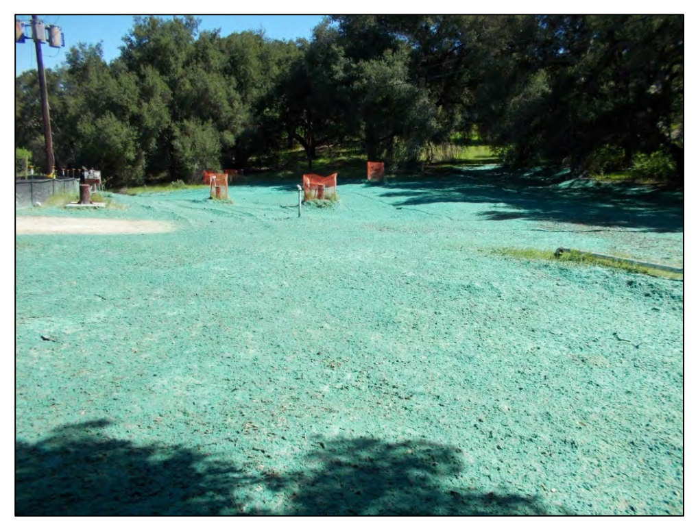
View of ISRA area AP/STP-1E-2 after hydroseed application with AP/STP-1E-1 in foreground (3/8/2013, looking east).