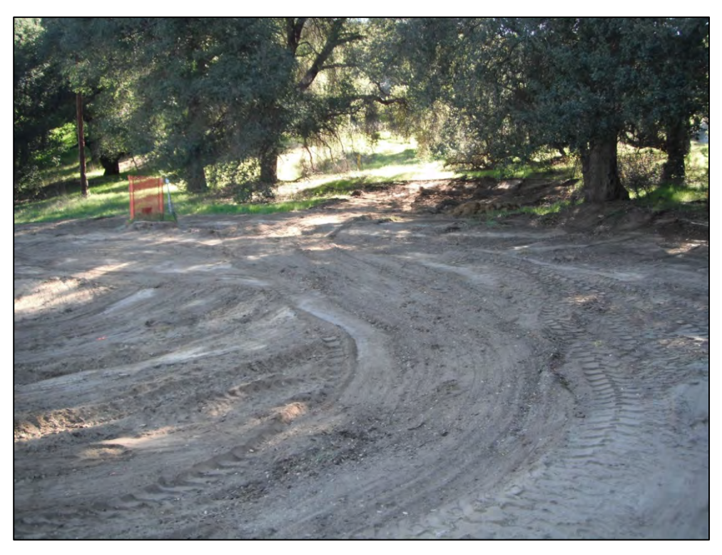
View of ISRA area AP/STP-1E-3 during soil contouring and prior to hydroseed application (2/28/2013, looking southeast).