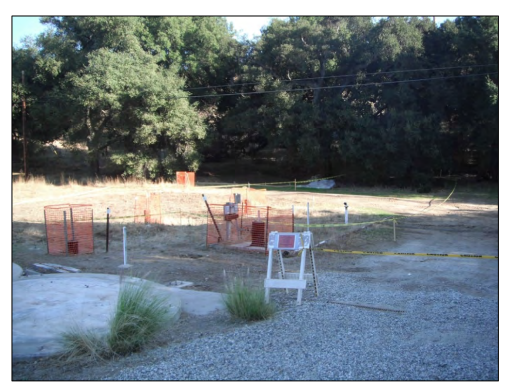
View of ISRA area AP/STP-1E-2 after vegetation clearance (10/19/2011, looking southwest).