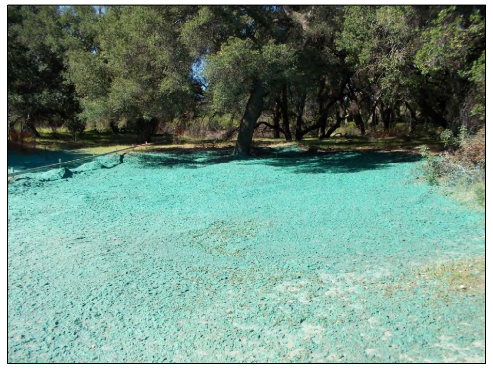
View of ISRA area AP/STP-1E-1 after hydroseed application (3/8/2011, looking west).