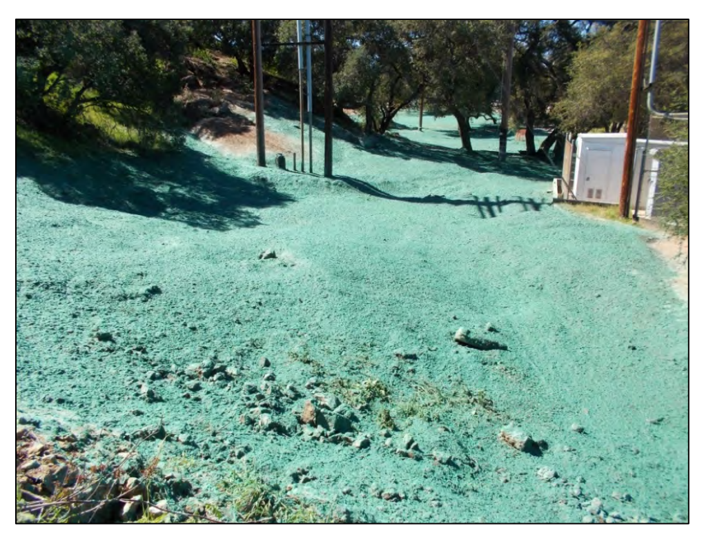
View of ISRA area AP/STP-1C-2 after hydroseed application (3/8/2013, looking west).