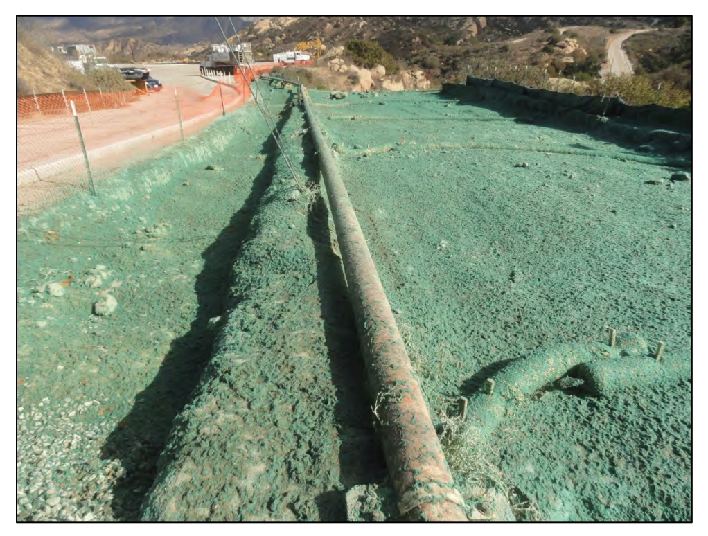
View of ISRA area ELV-1C (eastern portion) after restoration and hydroseeding (11/27/13, looking east).