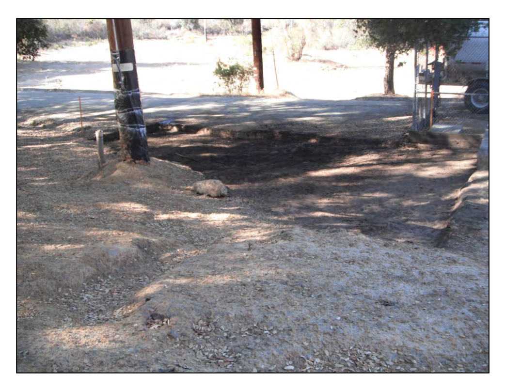
View of ISRA area AP/STP-1C-2 additional removal area (12/3/2013).