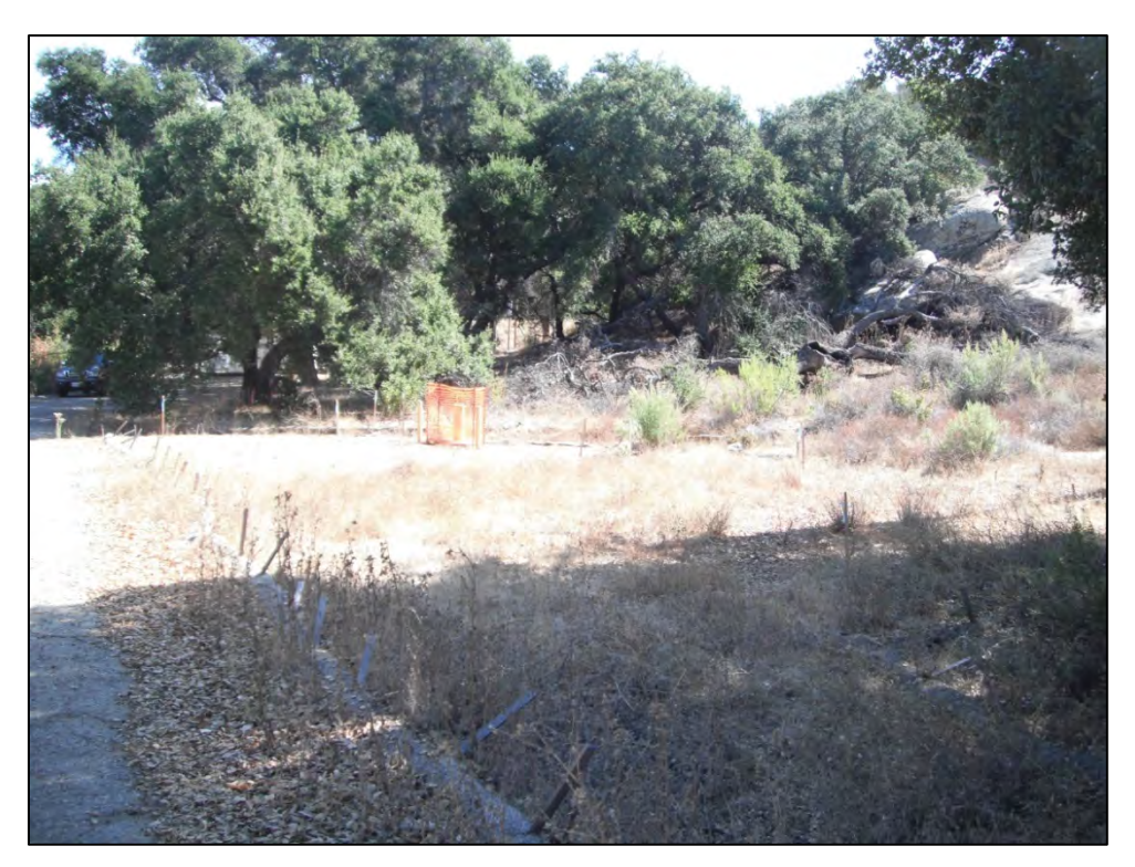
View of ISRA area AP/STP-1C-2 (western portion) prior to vegetation clearance with AP/STP-1B in foreground (10/10/2011, looking southeast).