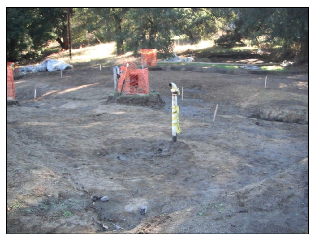
View of ISRA area AP/STP-1E-2 post-excavation and during confirmation soil sampling (11/14/2011, looking southeast).