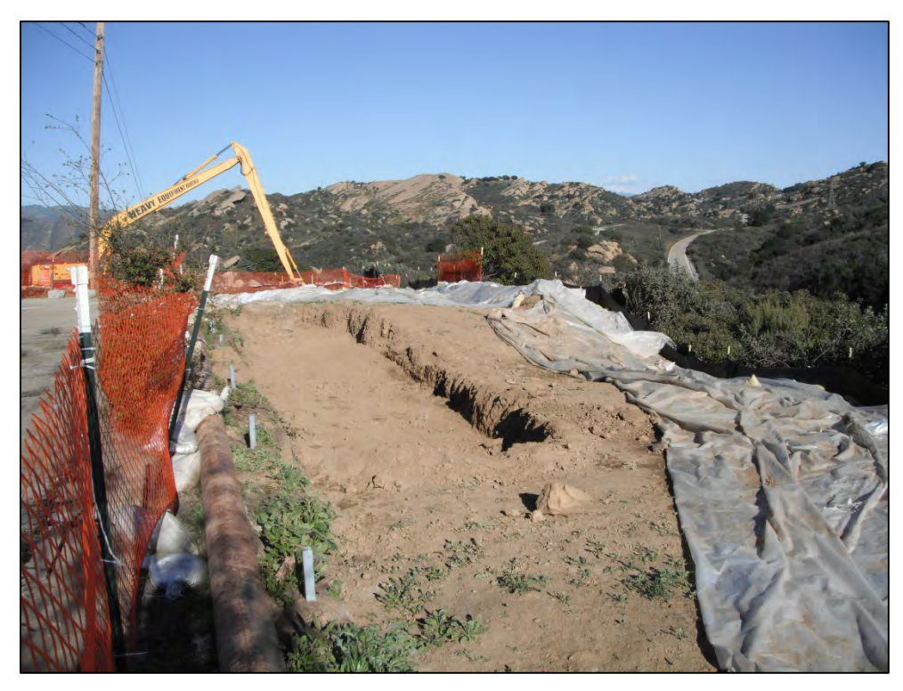
View of ISRA area ELV-1C (western portion) during additional soil removal activities (2/20/13, looking east).