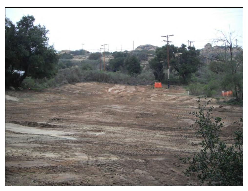
View of ISRA area AP/STP-1C-1 (western portion) after contouring (3/4/2013, looking northwest).