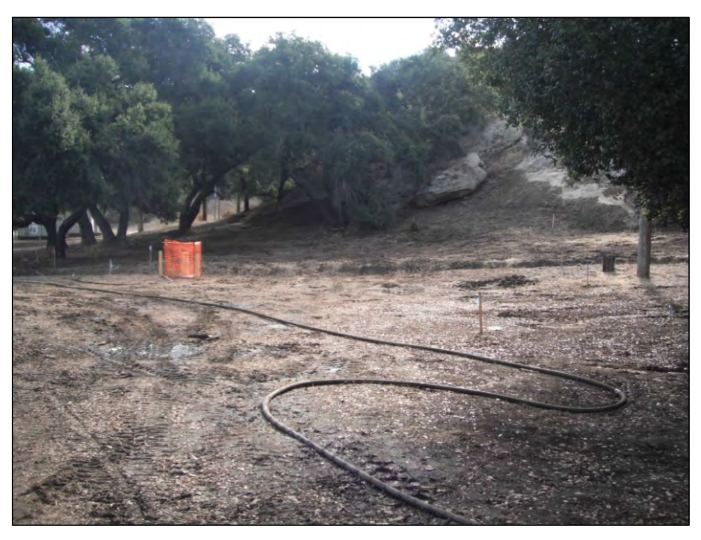
View of ISRA area AP/STP-1B prior to excavation (10/14/2011, looking southeast).