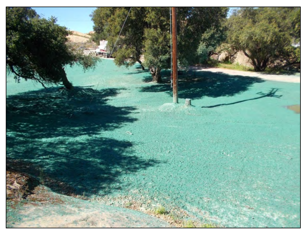
View of ISRA area AP/STP-1B (eastern portion) after hydroseed application (3/8/2013, looking northwest).