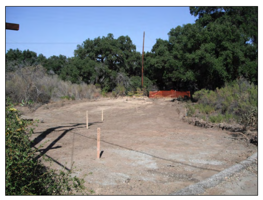
View of ISRA area AP/STP-1C-1 (near southeast corner) after excavation activities (9/26/2012, looking northeast).