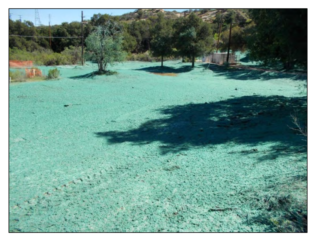
View of ISRA area AP/STP-1C-1 (western portion) after hydroseed application (3/8/2013, looking southeast).