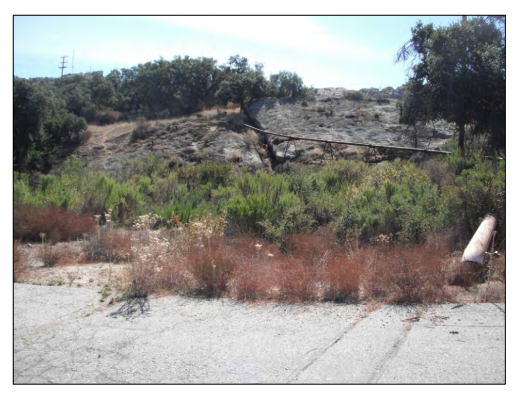
View of ISRA area AP/STP-1B prior to vegetation clearance (10/10/2011, looking south).