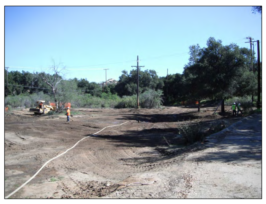
View of ISRA area AP/STP-1C-1 (near southwest corner) during contouring (3/1/2013, looking northeast).