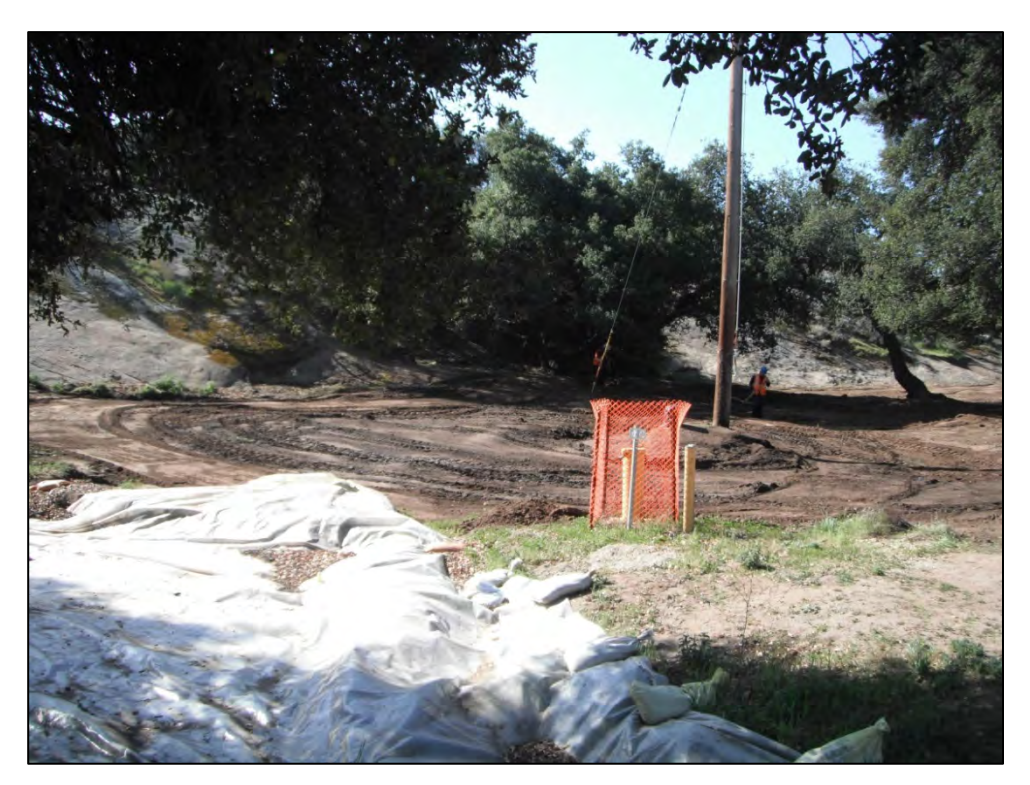
View of ISRA area AP/STP-1B during soil contouring of eastern portion prior to hydroseeding (3/5/2013, looking south-southwest).