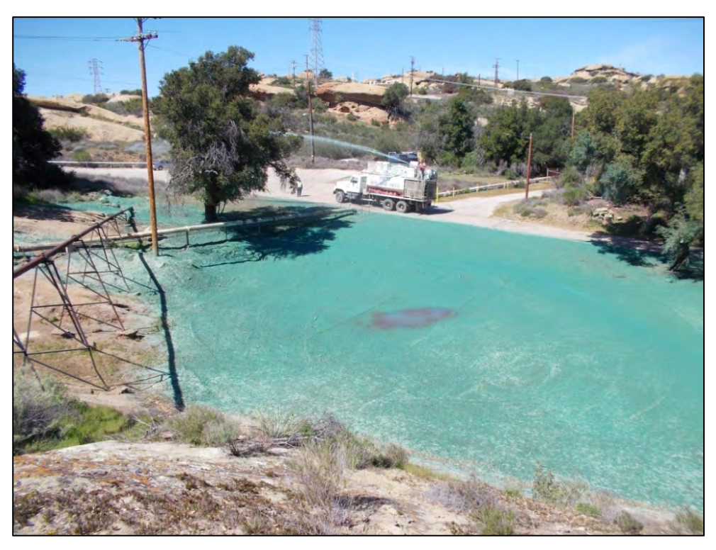
View of ISRA area AP/STP-1B (western portion) after hydroseed application (3/8/2013, looking northwest).