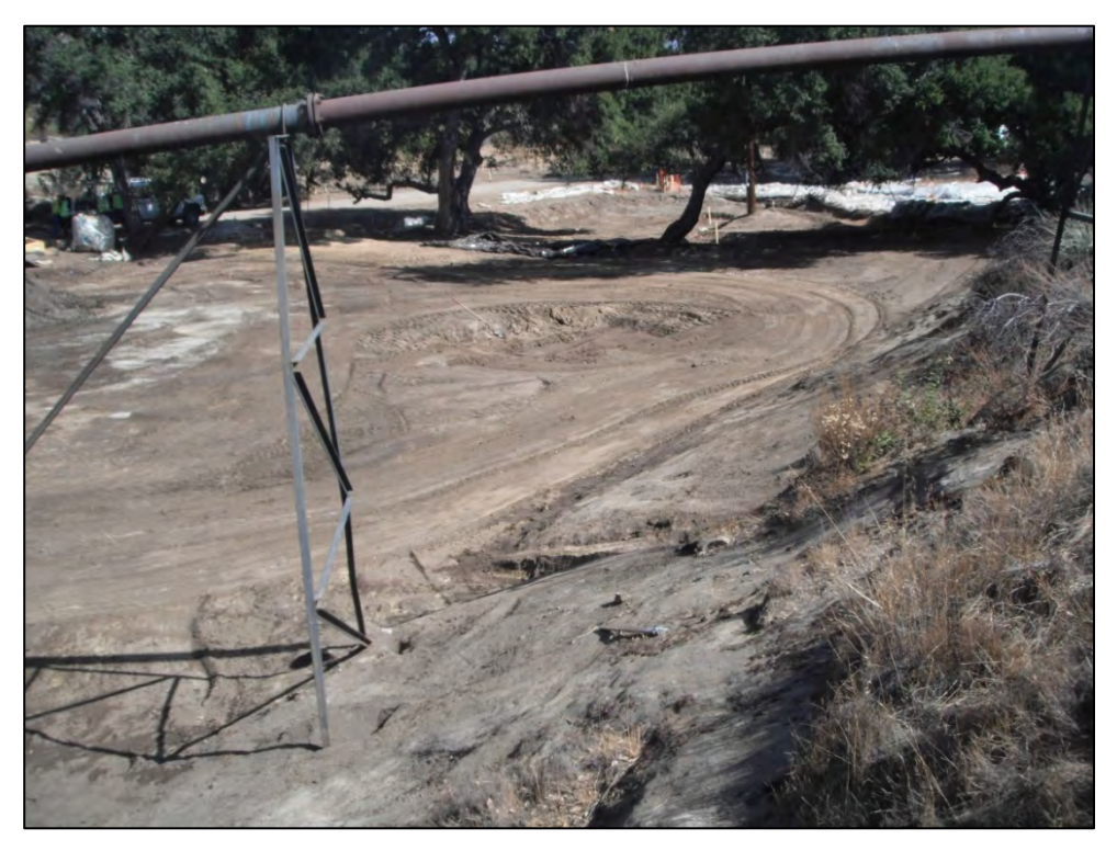
View of ISRA area AP/STP-1B from southwest corner after excavation (10/5/2012, looking northeast).