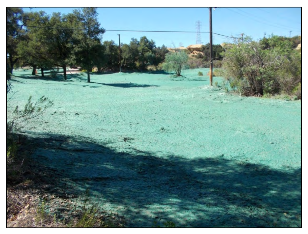
View of ISRA area AP/STP-1C-1 (eastern portion) after hydroseed application (3/8/2013, looking west).