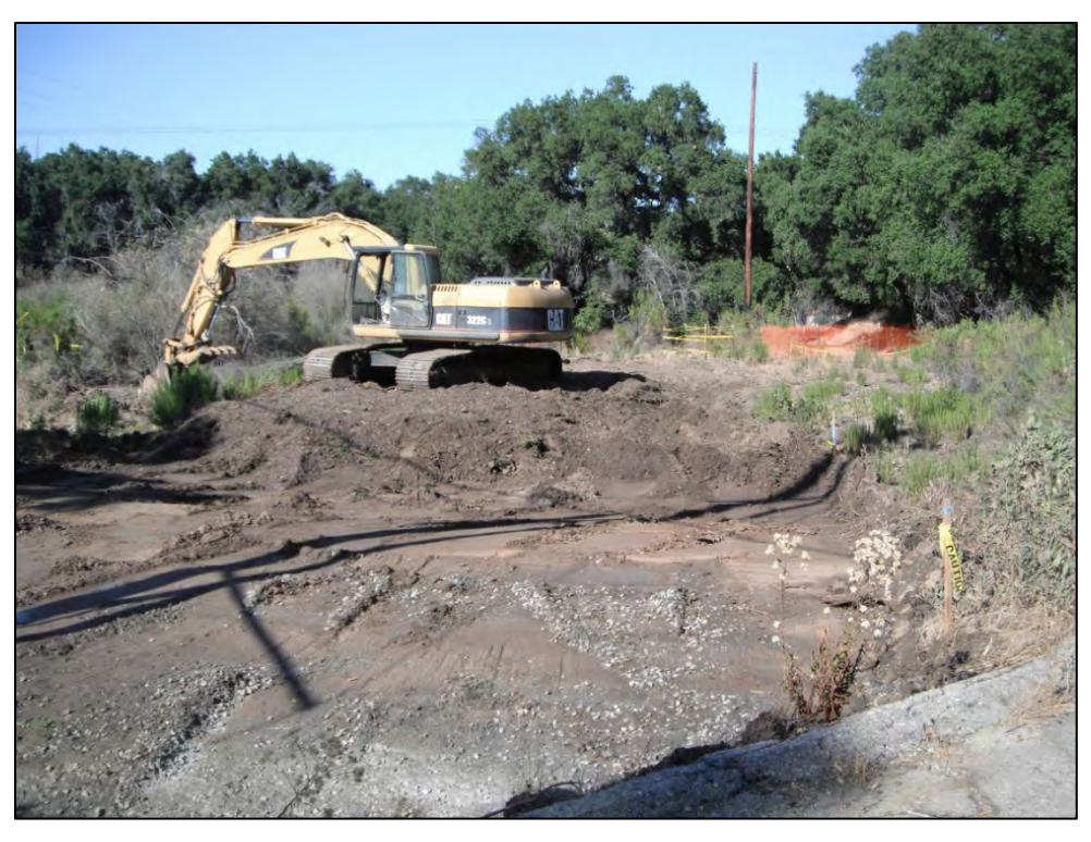
View of ISRA area AP/STP-1C-1 (near southeast corner) during excavation activities (9/13/2012, looking northeast).