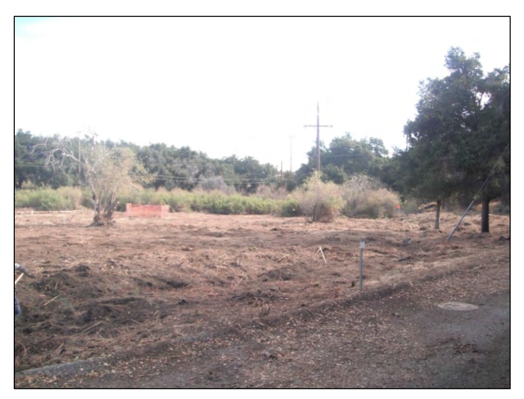
View of ISRA area AP/STP-1C-1 (near southwest corner) after vegetation clearance and prior to excavation (11/22/2011, looking northeast).