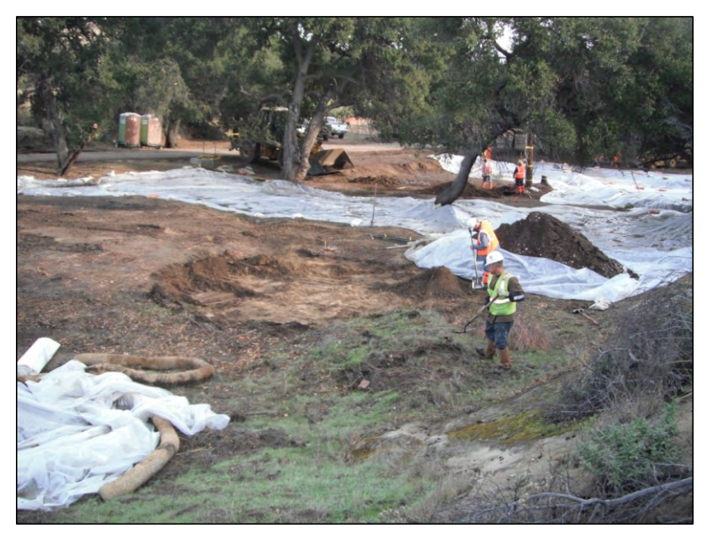
View of ISRA area AP/STP-1B during excavation of central and eastern portion (11/23/2011, looking northeast). Excavation area was covered during rain events.