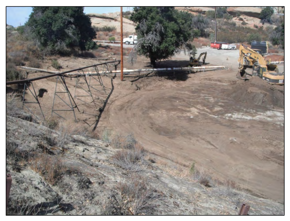
View of ISRA area AP/STP-1B during excavation of western portion (10/5/2012, looking northwest).