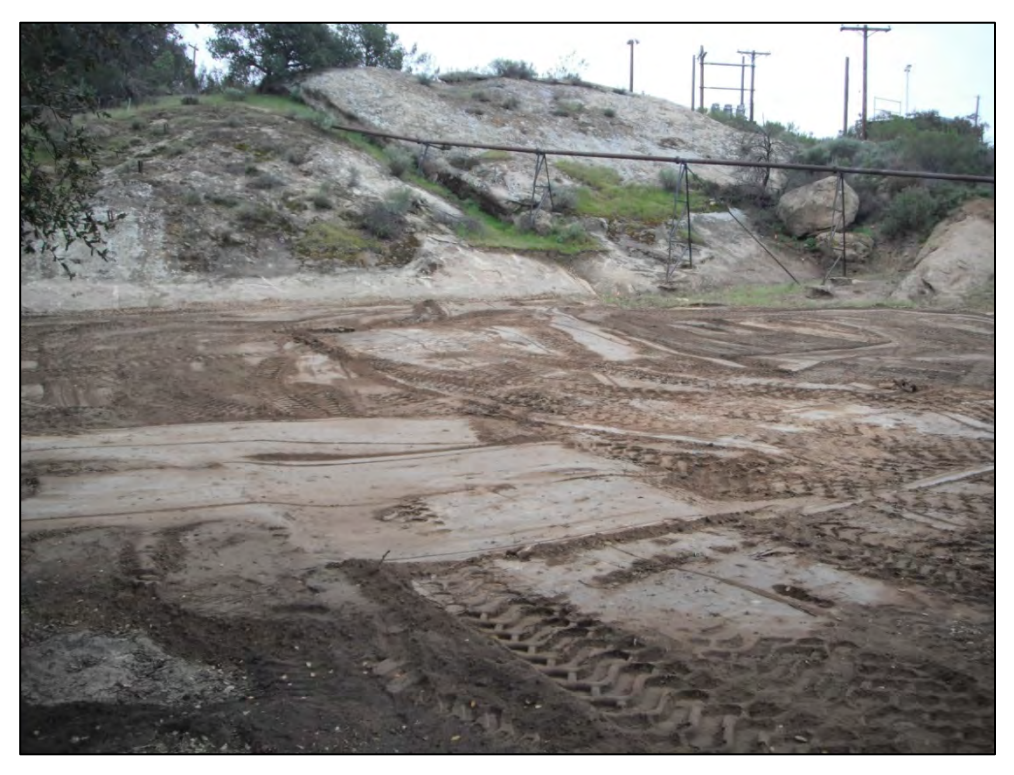
View of ISRA area AP/STP-1B during soil contouring of western portion prior to hydroseeding (3/5/2013, looking south-southwest).