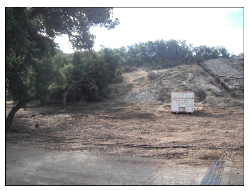
View of ISRA area AP/STP-1B prior to excavation (10/14/2011, looking south).