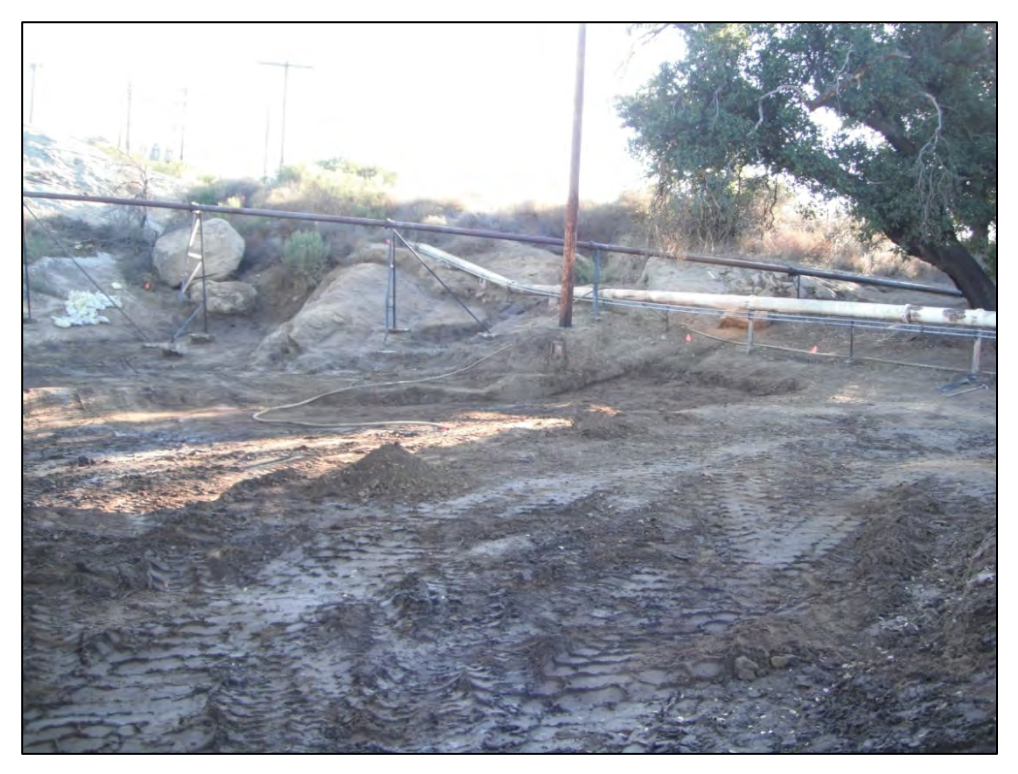
View of ISRA area AP/STP-1B during additional soil removal of western portion (11/6/2012, looking southwest).