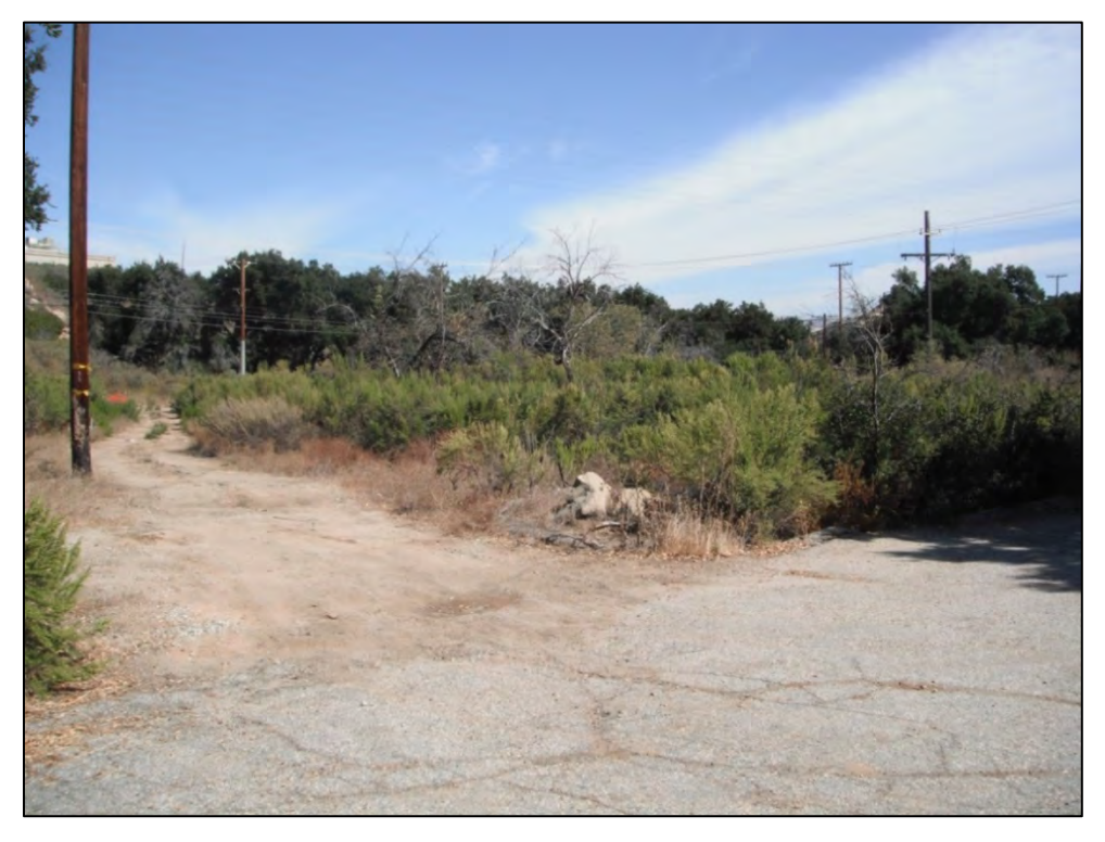
View of ISRA area AP/STP-1C-1 (southwest corner) prior to vegetation clearance (10/10/2011, looking northeast).