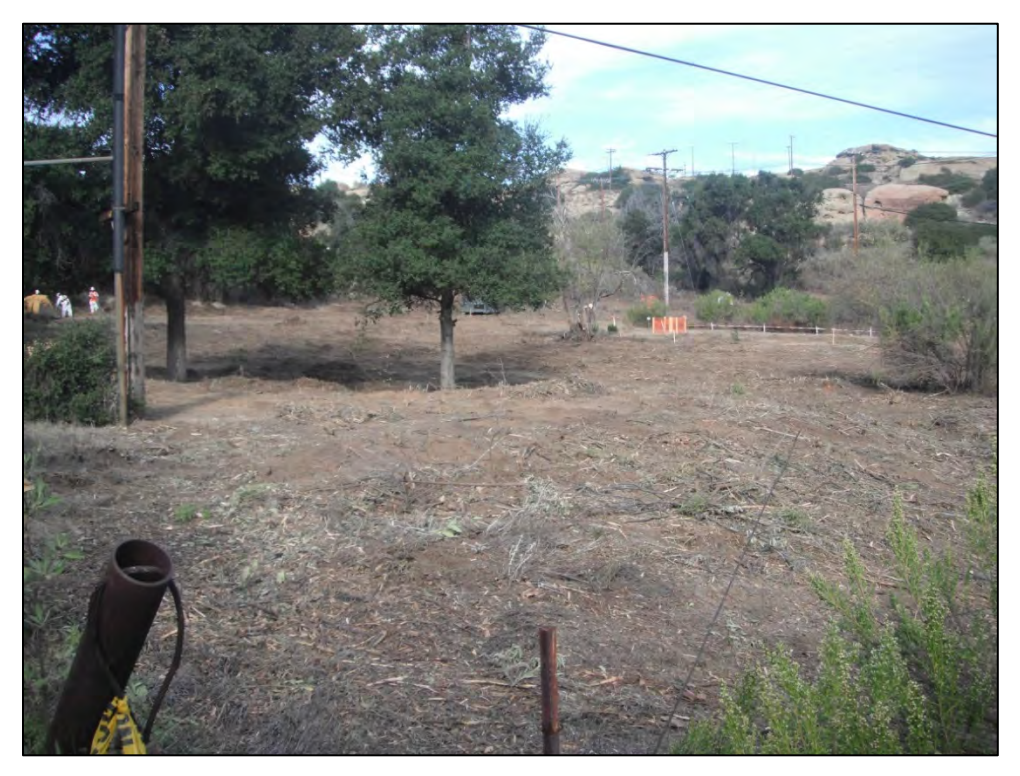
View of ISRA area AP/STP-1C-1 (near southeast corner) after vegetation clearance and prior to excavation (11/22/2011, looking northwest).