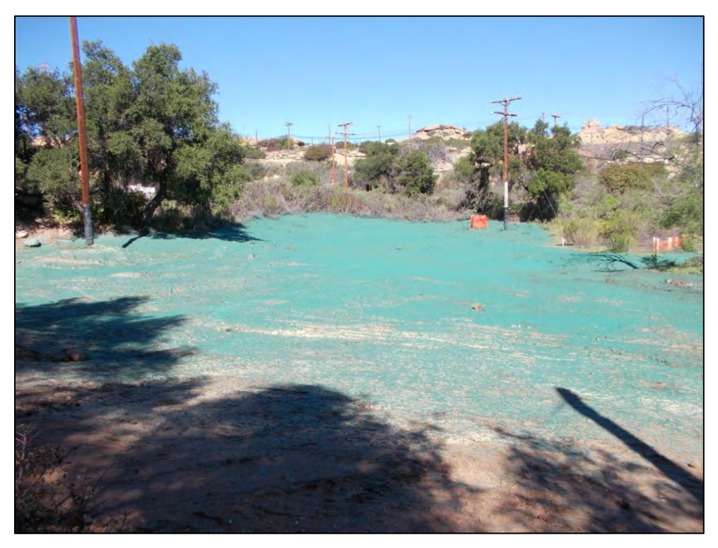
View of ISRA area AP/STP-1C-1 (western portion) after hydroseed application (3/8/2013, looking northwest).