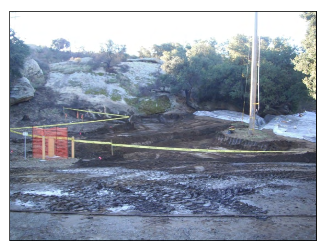
View of ISRA area AP/STP-1B during excavation of eastern portion (11/17/2011, looking south). Plastic tarps placed over excavation area during rain events.